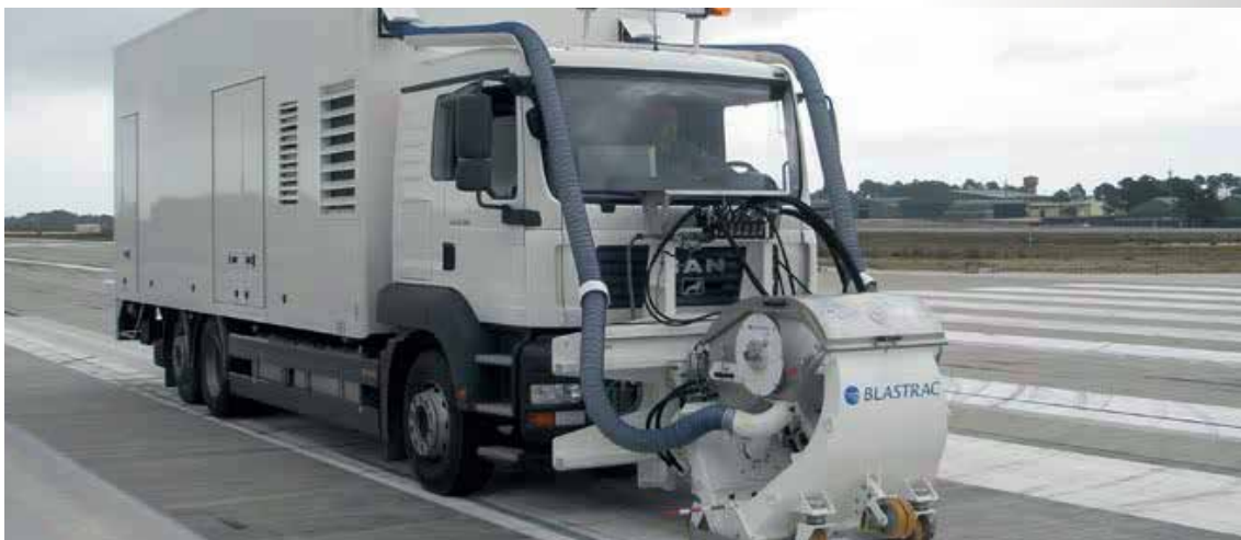
Blastrac's 2-45DTM truck-mounted shot blaster

Typical application has been around decorative, industrial flooring and remediation works. The aviation industry has become a key customer, as our products are ideal for the life extension of runway tarmac which has constant attention for build-up of rubber and “white lining” renovation.