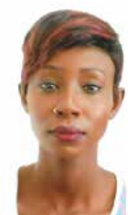
Muareen Atieno Protec Consultancy

“We are delighted to have launched the Groupe Protec family into the African market. We believe that our existing and new clients will enjoy the benefit of purchase synergy across consultancy, training, products, hire services, maximising efficiency and cutting costs considerably.”