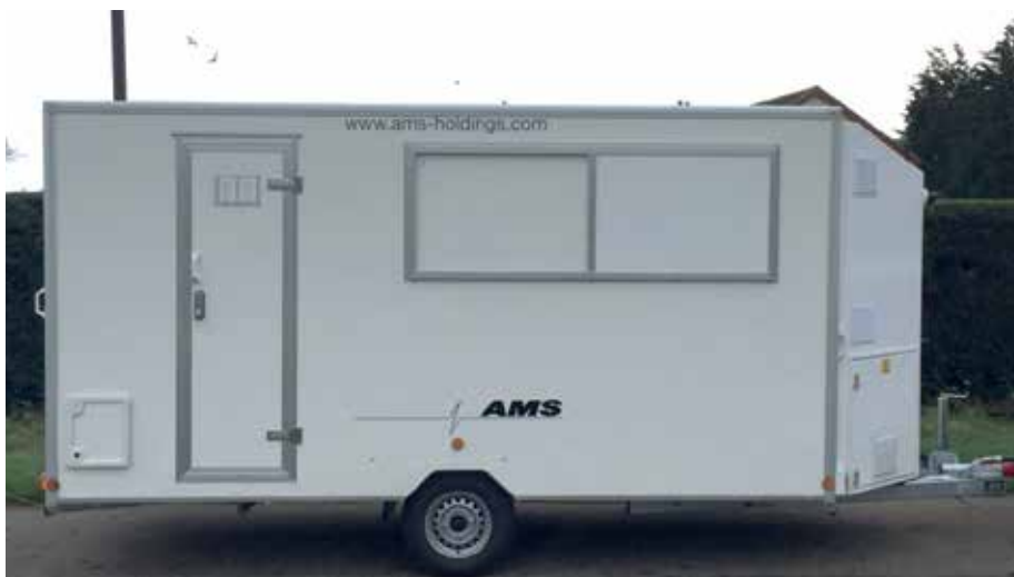
AMS Welfare Unit

As we have an outstanding knowledge of the asbestos industry, we are also able to manage bespoke projects and provide unique solutions to some of the world's most difficult asbestos problems that we are currently faced with.