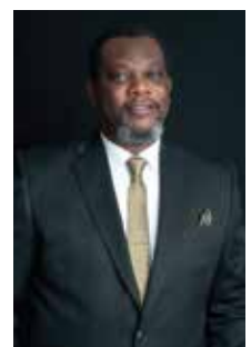
Wale Bakare Protec Consultancy