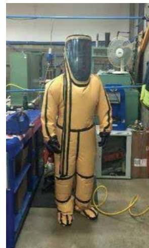
Full Suit AirFed - High Risk